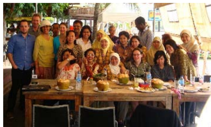
Group celebratory meal to close the workshop