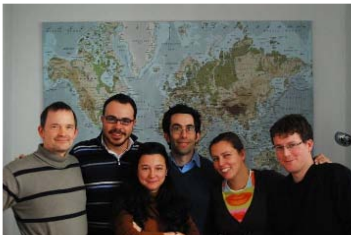
The EAN Board watching over the World in Amsterdam