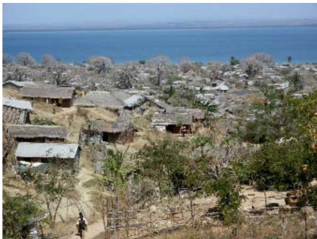
Village on the road between Pemba and Metuge, Cabo Delgado Province, Mozambique