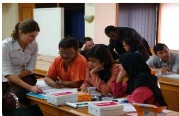
Working on a case study during the workshop