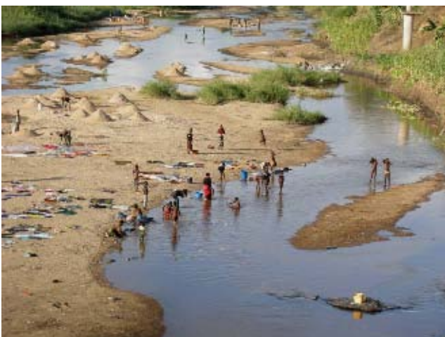
Bathing and laundering in Rio Lúrio, Nampula Province, Mozambique